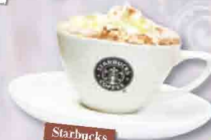
Starbucks Hot Chocolate: £2.35