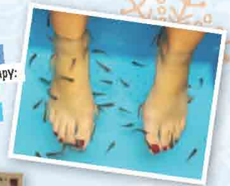
Dr sparish Pedicure Therapy: £10.00 for 15 minutes