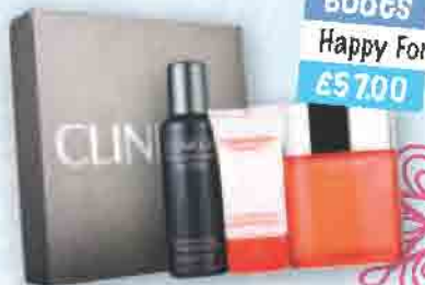
Boots Happy For Him Gift Set: £57.00

Get the luxe factor this season with our selection of festive fixes. High Chelmer's wellbeing wonders, beauty booty, scent-sational saviours and make up mecca will ensure you have a flawless finish from the boudoir to the boardroom!