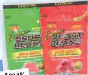
GNC Sports Beans: £1.49 each