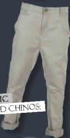
REPUBLIC CRAFTED CHINOS: £39.99