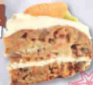
The Market Square Café Carrot Cake: £1.79