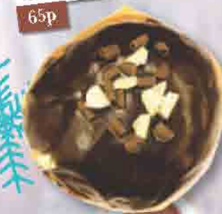
Greggs Filled Donut: 65p