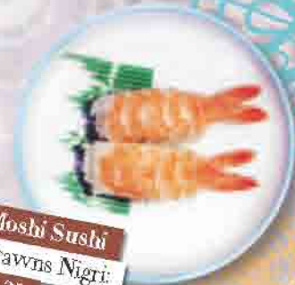
Moshi Sushi Prawns Nigiri: £3.25