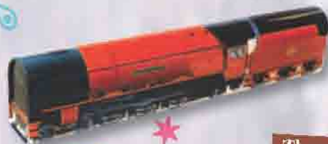
Sugacane Sweet-filled Duchess Train: £7.99