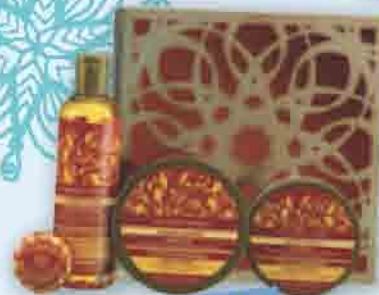
The Body Shop Candied Ginger Body & Lip Care Collection: £15.00