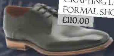
CLARKS CRAFTING LIFE MEN'S FORMAL SHOES: £110.00

FASHIONISTA FELLAS AND CHERISHED CHAPS WILL BE SPOILT FOR CHOICE THIS CHRISTMAS AT HIGH CHELMER. FROM COCKTAIL PARTY COUTURE TO TRADITIONAL TAILORING AND COLOURFUL COUNTRY HERITAGE TO SOUGHT-AFTER SPORTY STYLES, OUR MENSWEAR STORES ARE HEAVING WITH HEAD-TURNING THREADS AND ACCESSORIES.