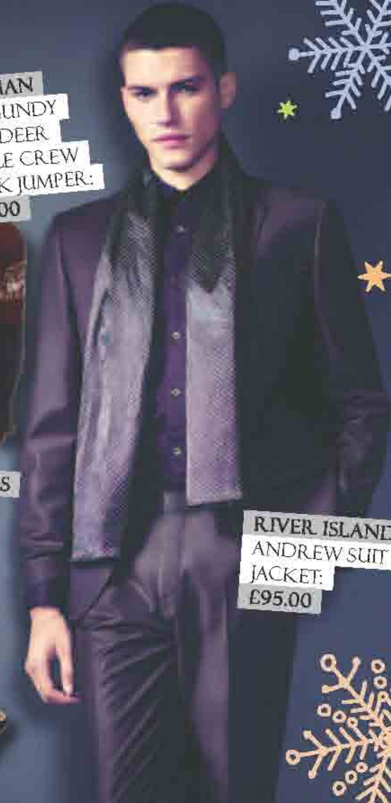
RIVER ISLAND ANDREW SUIT JACKET: £95.00