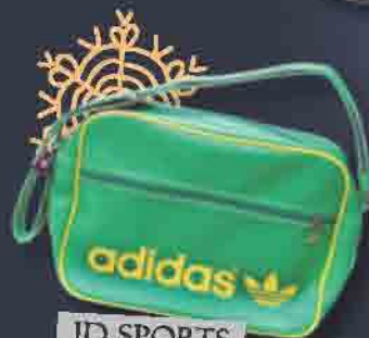
JD SPORTS ADIDAS STYLE BAG: £34.99