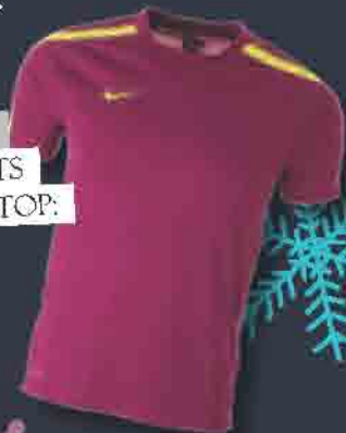
JJB SPORTS NIKE SPORTS TRAINING TOP: £19.99