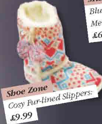
Shoe Zone Cosy Fur-lined Slippers: £9.99