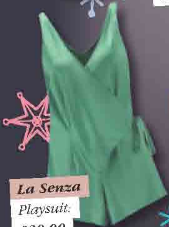
La Senza Playsuit: £30.00 (Designed by Paloma Faith)