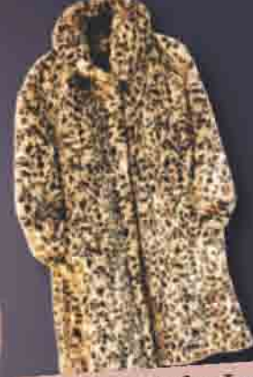
Buy Labels for Less Leopard Fur Coat: £100.00