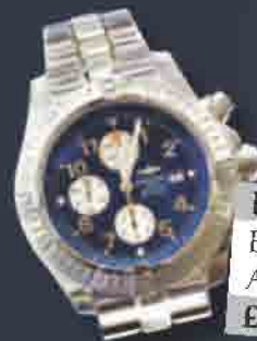
H&T PAWNBROKERS BREITLING SUPER AVENGER WATCH: £2,400.00