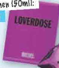
The fragrance shop Diesel Loverdose EDP for Women (50ml): £46.99