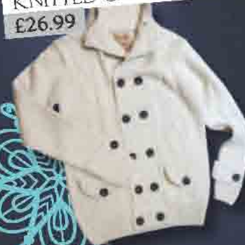
BLUE INC KNITTED CARDIGAN: £26.99