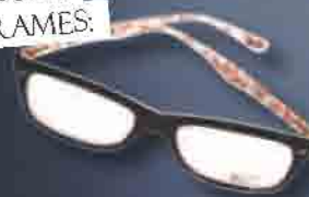
BLINK OPTICIANS RAY BAN OPTICAL 'ELECTION' FRAMES: £120.00