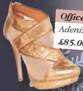
Office Adenine Shoes: £85.00