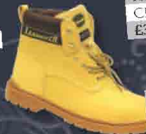
DEICHMANN SHOES LAND ROVER STEEL TOE CAP BOOTS: £29.99