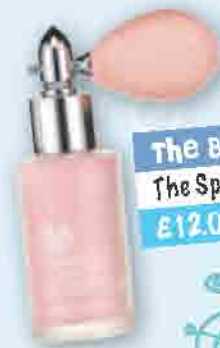
The Body Shop The Sparkler: £12.00