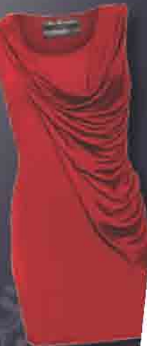
Pilot Sleeveless Body Drape Dress: £17.99