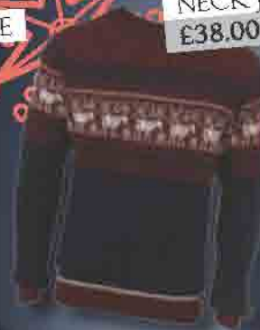
TOPMAN BURGUNDY REINDEER CABLE CREW NECK JUMPER: £38.00