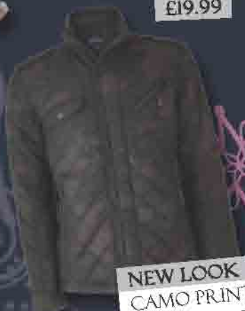
NEW LOOK CAMO PRINT QUILTED JACKET: £39.99