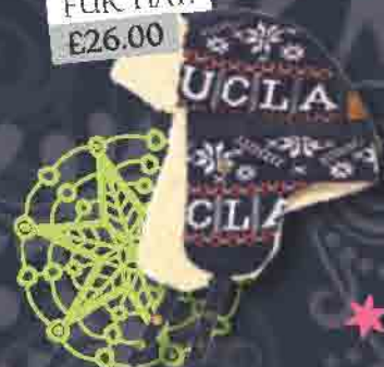
BASE UCLA CANADIAN FUR HAT: £26.00