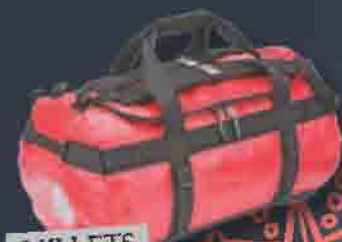
MILLETS THE NORTH FACE BASE CAMP DUFFEL BAG: £89.99