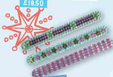
Beauty Plus Bejewelled Nail Files: £3.00 each