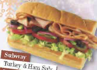
Subway Turkey & Ham Sub: £2.99