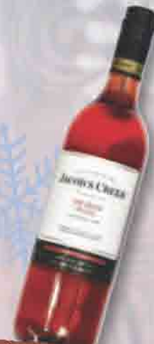
Co-operative Food Store Jacobs Creek Shiraz Rose: £7.82