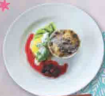
The Corner Lounge Apple Crumble: £4.95

Eat, drink and be merry at High Chelmer this Christmas! From winter warmers and tempting tipples to gourmet goodies and festive feasts, our restaurants and eateries will keep those hunger pangs at bay all season long.