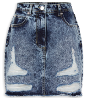
New Look, £22.99