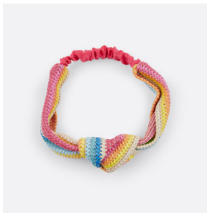
New Look, £5.99