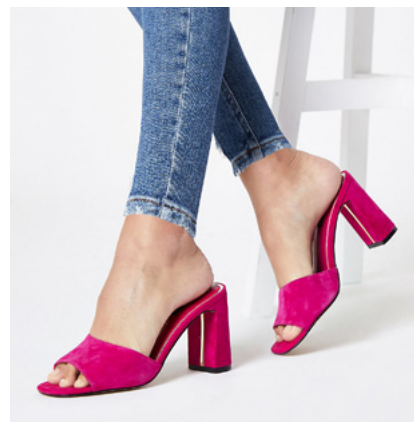
River Island, £45