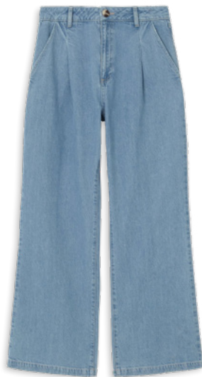
Miss Selfridge, £42