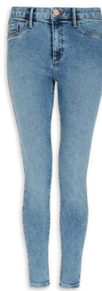
River Island, £35