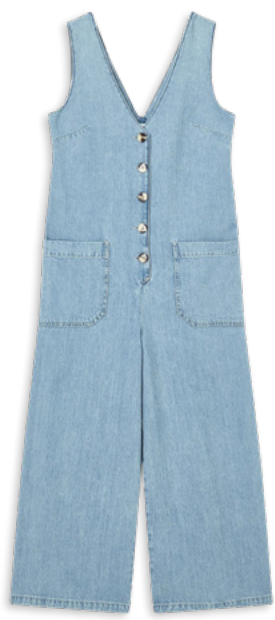
Miss Selfridge, £49